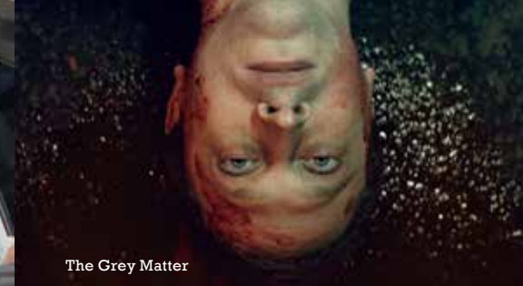
The Grey Matter