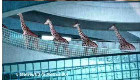
5 Metres 80 (5 Mètres 80)