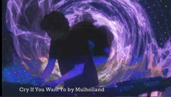
Cry If You Want To by Mulholland

Screening details Estimated total run time: 79 minutes. Censorship ratings to be advised. Please contact your cinema for details.