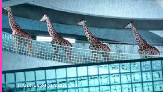
5 Metres 80 (5 Mètres 80)

Screening details Estimated total run time: 74 minutes. Censorship ratings to be advised. Please contact your cinema for details.