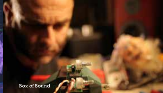
Box of Sound