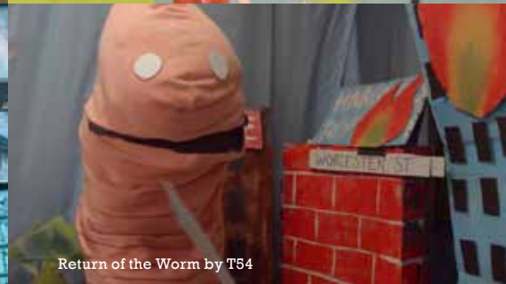
Return of the Worm by T54