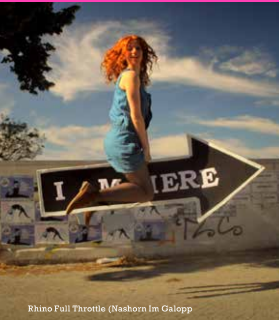
Rhino Full Throttle (Nashorn Im Galopp)