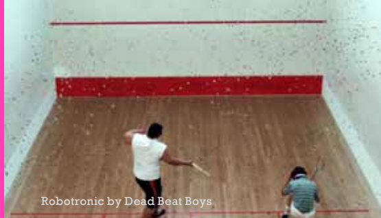
Robotronic by Dead Beat Boys

Screening details Estimated total run time: 92 minutes. Censorship ratings to be advised. Please contact your cinema for details.