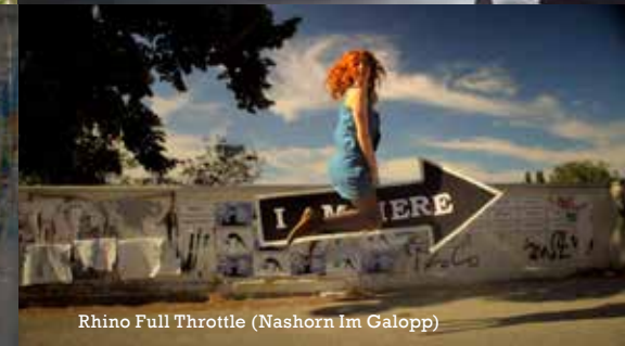
Rhino Full Throttle (Nashorn Im Galopp)