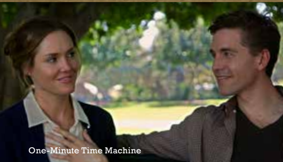
One-Minute Time Machine