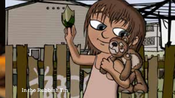
In the Rubbish Tin