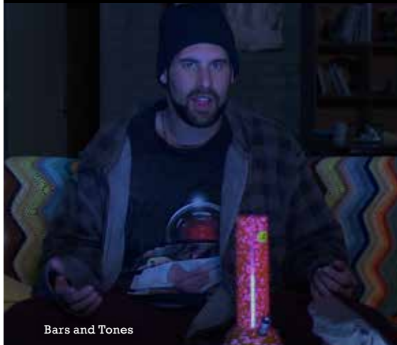
Bars and Tones