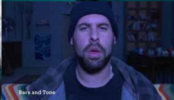
Bars and Tone

In an homage to friendship, this collection of short films explores the ties of platonic love. Will they break when stretched or grow stronger, and how far will we go to prove our loyalty?