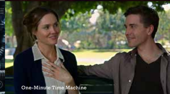
One-Minute Time Machine

We're all time travellers of a sort. Crossing bridges from one decade into another. Stepping between different realities that exist side by side in the same towns and cities. The people in these stories are really doing it though. Pushing the boundaries to explore new worlds, and bend the laws of physics.