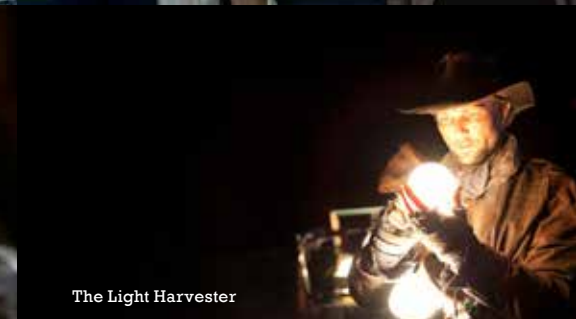
The Light Harvester