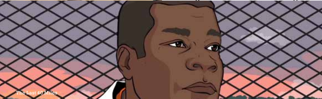
The Last 40 Miles

Gather around the campfire. These short films have tales to tell from the margins of society. From the mouths of children, outcasts, misfits and criminals, come the most articulate, delightful and moving stories you will hear this year.