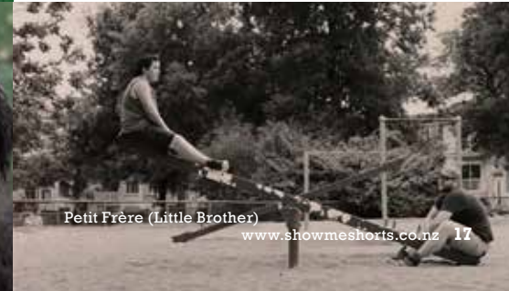
Petit Frère (Little Brother)