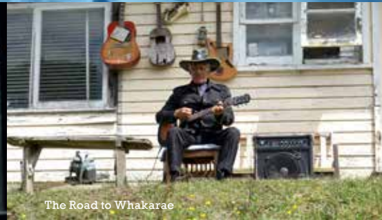
The Road to Whakarae