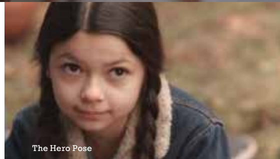
The Hero Pose