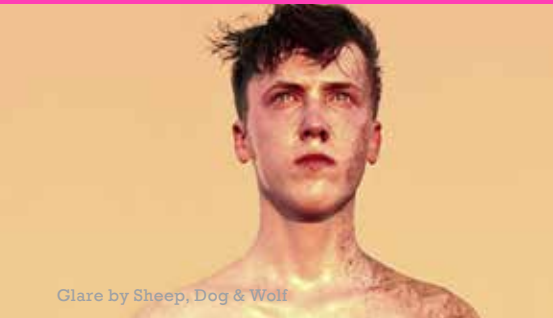
Glare by Sheep, Dog & Wolf