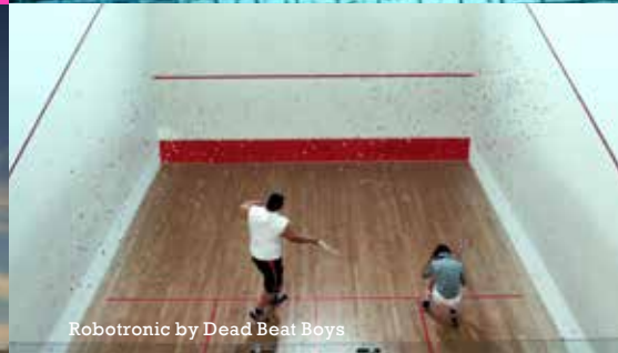
Robotronic by Dead Beat Boys