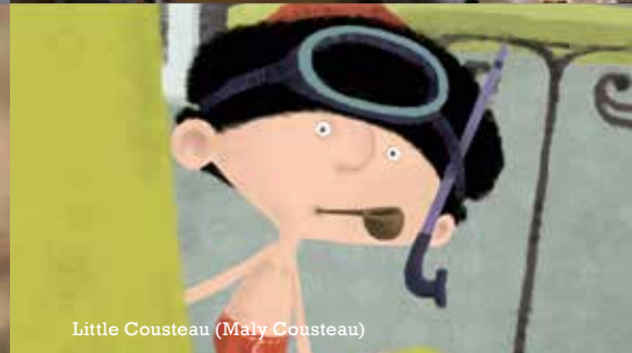
Little Cousteau (Maly Cousteau)